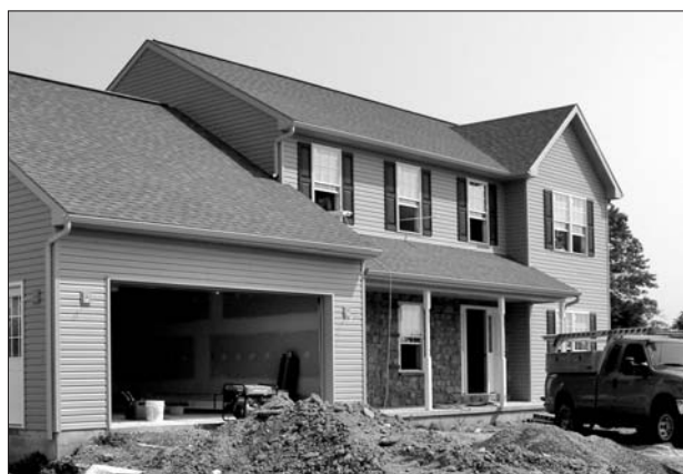
Our charity fundraiser spec house in Fredericksburg netted $85,700 to help fund our program and reduce some debt.